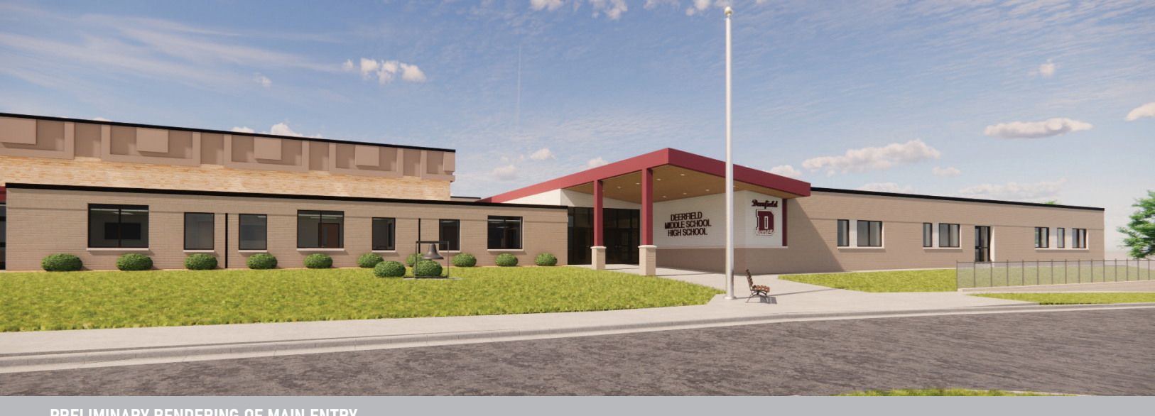
PRELIMINARY RENDERING OF MAIN ENTRY