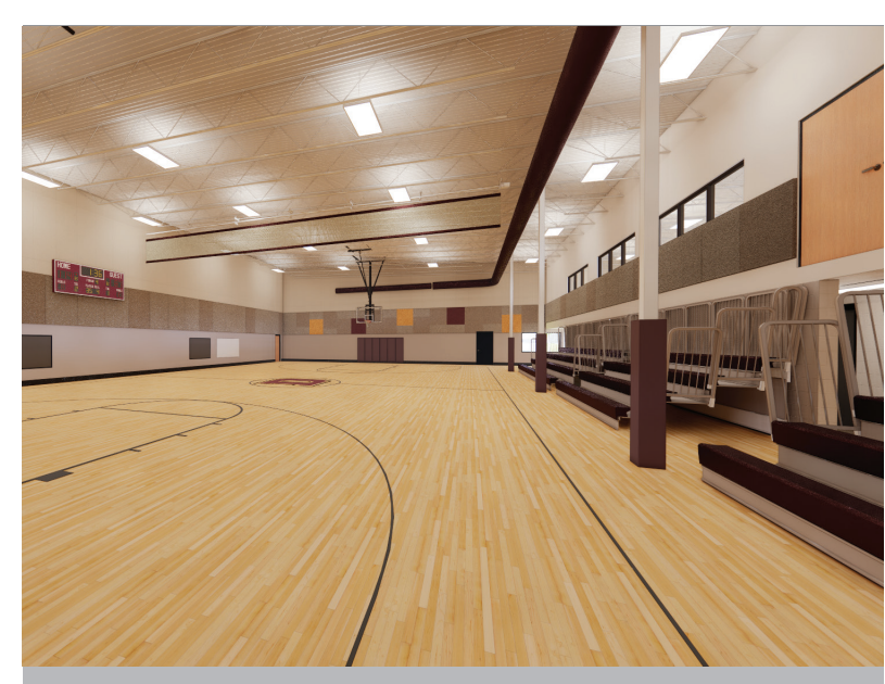
PRELIMINARY RENDERING OF SMALL GYM EXPANSION